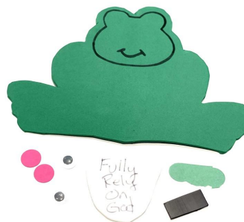
Prepared craft materials to go in small bags for each child